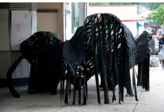
Creative installation by University of Maryland students outside a boarded-up historic theater.

Montgomery Housing Partnership started its creative community development work with an attitude that many little, colorful, fun actions can humanize space more effectively than one big project.